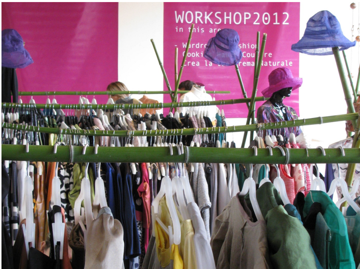
Fashion workshop for incubatees in the Fabbrica del Vapore

Since the renovation of the area is not yet completed, available space is likely to increase in the foreseeable future. Furthermore, other expansions, e.g. with an incubator, are being planned. This means more space could be rented out, which may considerably improve the financial position of the Fabbrica.