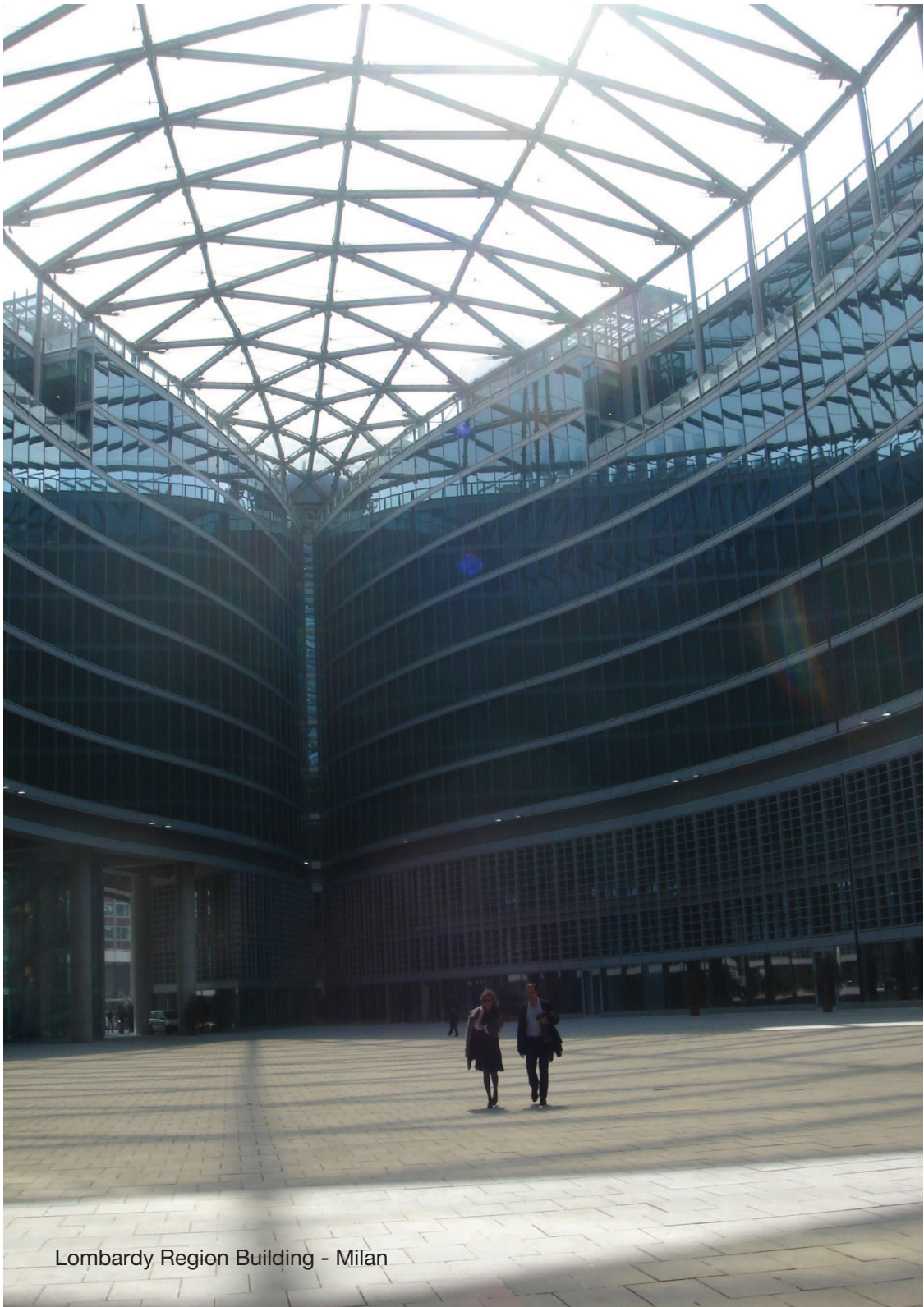
Lombardy Region Building - Milan