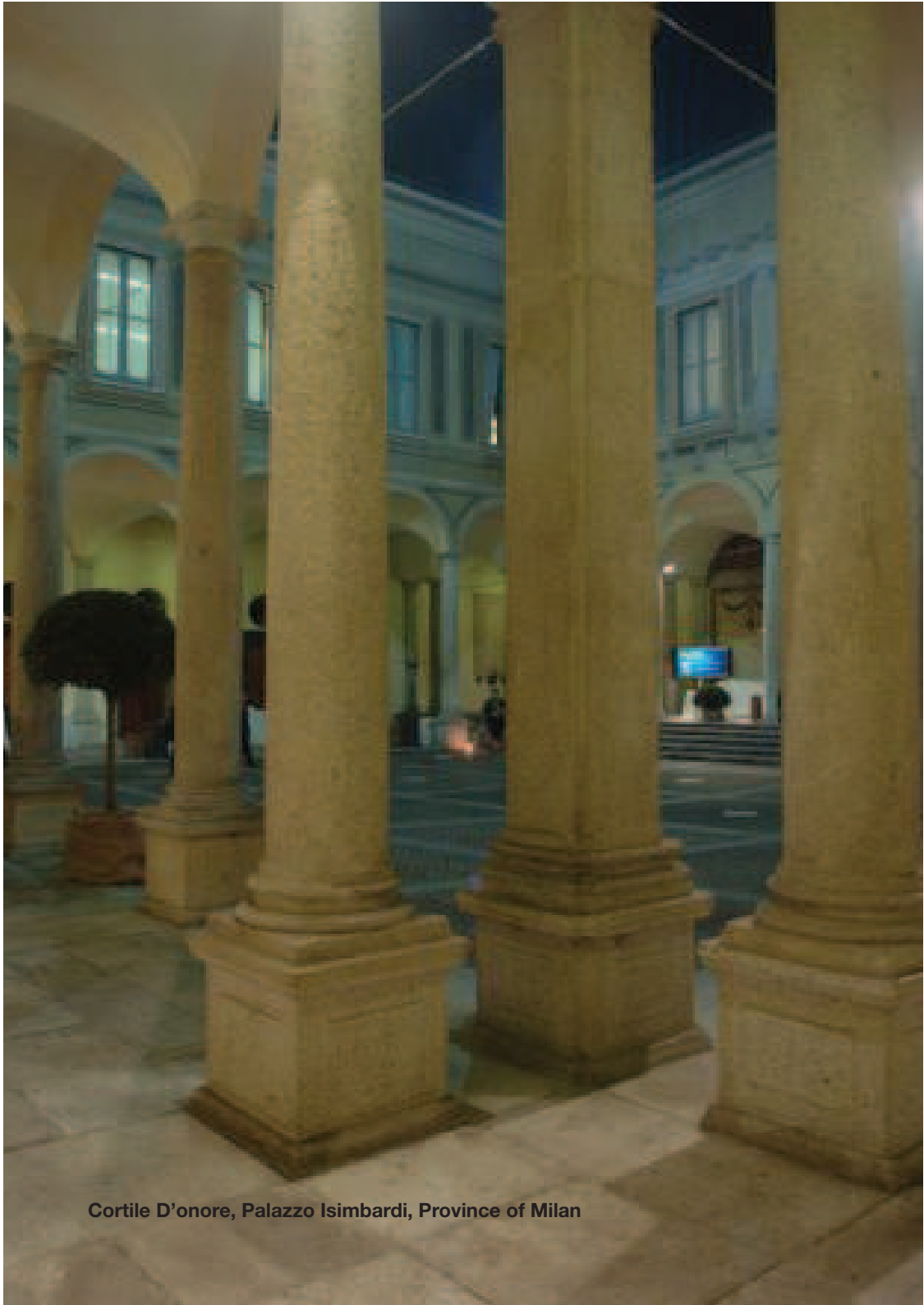
Cortile D'onore, Palazzo Isimbardi, Province of Milan