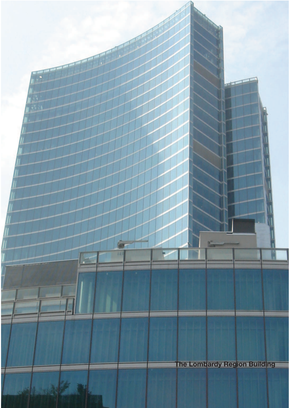
The Lombardy Region Building