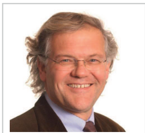
Stefaan de Clerck Mayor Kortrijk and President of Designregio Kortrijk

Stefaan de Clerck , born in Kortrijk - 12/12/1951 Civil status: Married - father of five children Degree: "Licentiaat in de rechten" (equiv. LL.M.) - KULAK/KUL Occupation: Minister of Justice (30/12/08 – present)/ Burgomaster Former occupation: Lawyer